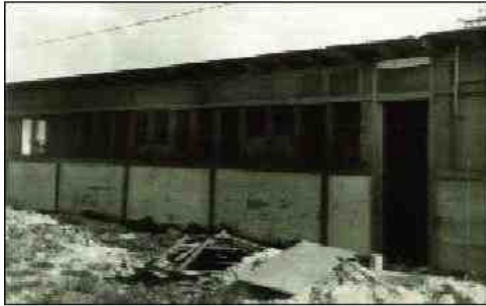
Kennel Building Construction Was Started March 1953

The handler's training was for anywhere between two or three weeks, depending upon the handler's attitude and abilities.