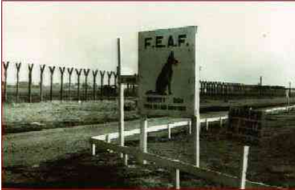
The FEAF Sentry Dog Training Center, Japan 1952

The first Air Force Sentry Dog School was activated on March 10, 1952 at Far East Air Forces (FEAF) Showa Air Station, Japan