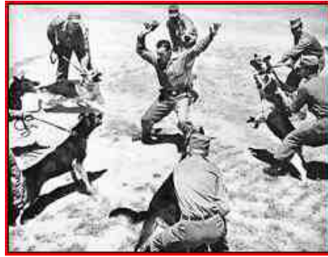
"Get Him." cried the handlers.