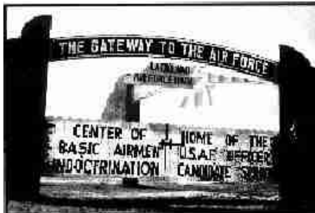
Lackland: The Gateway To The USAF

By February 1962, a shortage still existed, with another urgent appeal by the Quartermaster Corp for 560 dogs and then an additional 1,700 shepherds during the later part of '62. The QMC fell well short of this goal; it purchased only 524 dogs and received another 92 through donations.