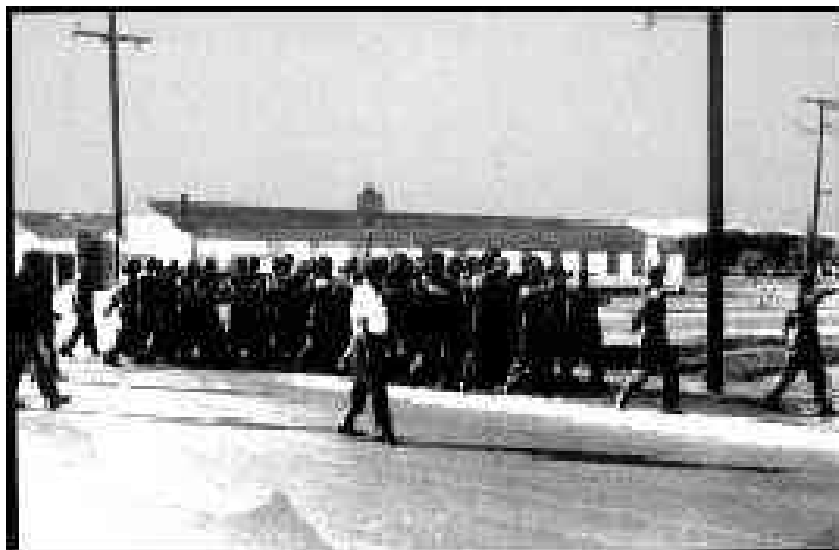
Lackland AFB Basic Training Center

In June 1964, the Air Force relieved the Army Quartermaster Corps of procuring all "live animals not raised for food" ...the Air Force would now purchase their own dogs, and train them at their new school at Lackland.