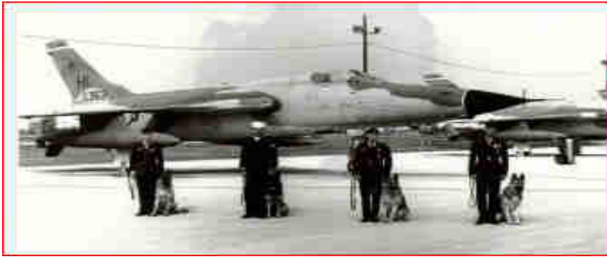
US: Air Force, Navy, Army and Marine K-9 Teams!