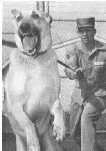
Lackland Sentry Dog School, Bldg 1130

They were one handler dogs, unlike the patrol and messenger dogs from WW II; they were a valuable tool in the US Air Force resource protection plan, but their use was limited to restricted, and isolated area.