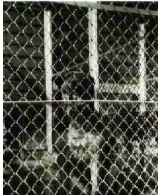
Showa's Dog Kennels and Lady F-433

And on March 13, 1953, construction of a new kennel building with thirty attached steel runs was started; twelve days later, on March 25, 1953, another new contract for the purchase of three hundred fifteen additional dogs was entered into with the "All Japan Shepherd Dog Association."