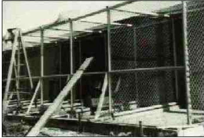
Kennel Building Construction Was Started March 1953