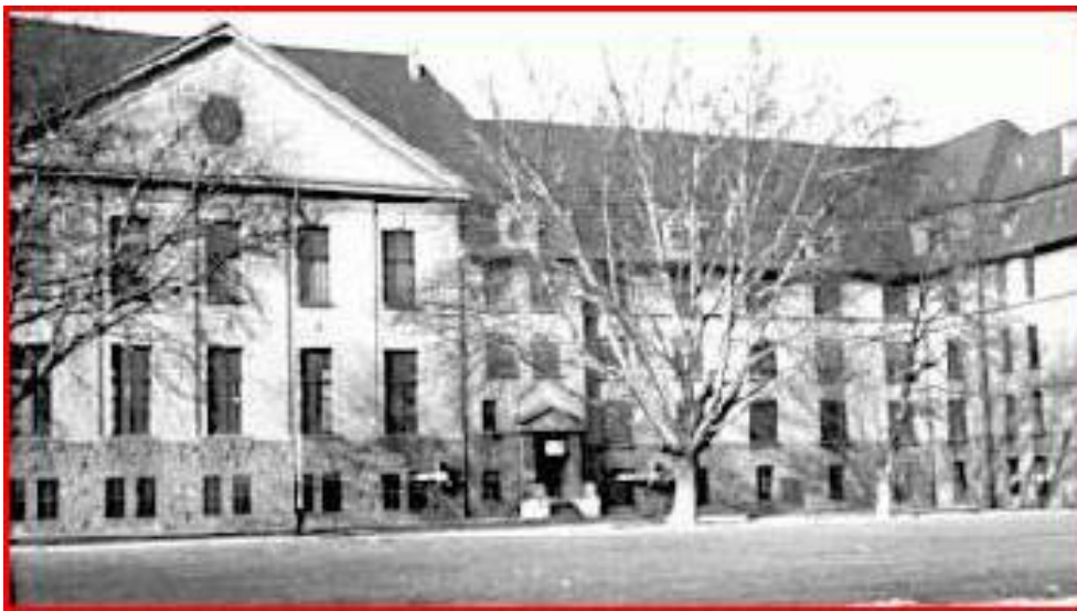
USAFE 17th AF K-9 Center, Wiesbaden, Germany

A second dog school, attached to the 17th AF, United States Air Forces Europe (USAFE), was opened in 1953, at Wiesbaden, West Germany, at the site of a former German officer's school. the Hindenburg Kaseme in the Biebrich suburb.