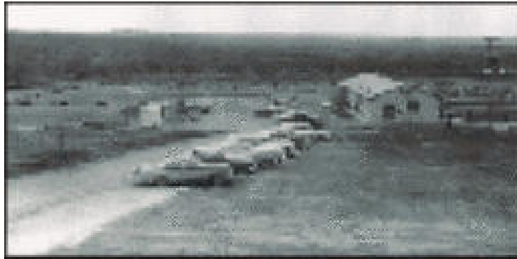
Lackland's "Dog School" and Kennels.

Sensing it was time to take matters into its own hands, the United States Air Force on October 20, 1958, established the Sentry Dog Training Branch of the Department of Security Police Training at Lackland AFB, near San Antonio, Texas.