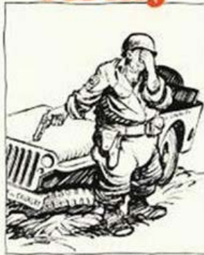
Bill Mauldin's Greatest World War II Cartoons