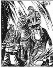
"L'atto dei Fiumani Nightingale."