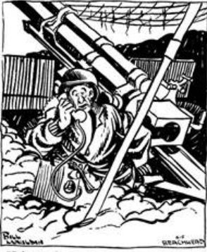
"Ordnance? Ah'n havin' trouble with mah shootin' arm."