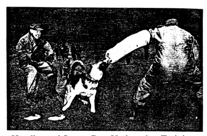
Handler and Sentry Dog Undergoing Training.

Potential handlers who fail to demonstrate a satisfactory attitude or adaptability to sentry dog work will be eliminated from the course of instruction and returned to their parent organizations.