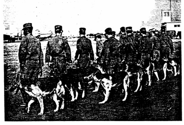
Dogs responding To "Heel" Command Given By Handlers at Moment Of Turning