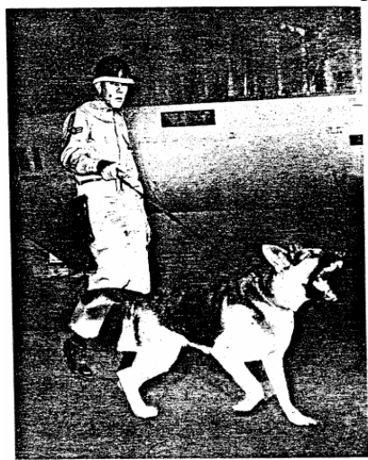
Handler and Sentry Dog On Duty

The greatest care will be exercised in selecting NCOs and airmen for duty with sentry dogs. Commanders of Air Police units should interview each potential handler to establish his interest in and suitability for duty with sentry dogs. It is necessary that handlers possess a natural, friendly and affectionate attitude toward animals. Potential handlers must be advised that they will be held completely and solely responsible for the care and training of their assigned sentry dogs and that duty with sentry dogs will normally be performed only at night. Any individual who evidences doubt or hesitation about participating in the program should be eliminated from further consideration. Experience has proven that the best Air Policemen make the best dog handlers.