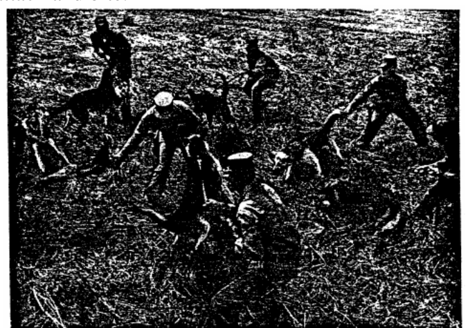
Dogs Being Put Through "Circle Agitation' Exercises.

(2) Circle Agitation . Handlers and sentry dogs form a circle and space themselves at 20 - 30-foot intervals. The agitator who may be equipped with either an attack sleeve or an attack suit and a switch takes position in the center of the circle. At the command MOVE IN the handlers and dogs move very slowly toward the agitator and the handlers order the dogs to WATCH HIM. At the same time the handlers begin taking up the slack in the leash until by the time the dog is within four feet of the handler, the handler is holding him by the leather work collar. This is necessary for the protection of the agitator and to eliminate the possibility of one dog attacking another. While the dogs are moving in, the agitator moves about using his switch on first one dog and then another. When the circle has been reduced to 8 or 10 feet in diameter, the handlers will halt and at the command MOVE OUT will resume their original positions. After this has been repeated several times and the handlers and dogs are in their original positions, the agitator will have handlers bring their dogs into the center of the circle one at a time for individual agitation and will allow the dogs to bite the sleeve or the suit. In this type of agitation, the aggressiveness of each dog stimulates aggressiveness in the other dogs and an emotional chain reaction is created. This is particularly effective in the case of dogs that are deficient in aggressiveness or slow to attack and bite.