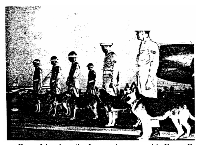
Sentry Dogs Lined up for Inspection at an Air Force Base.

2. Sentry Dogs in the Air Force Utilization of dogs by the Air Force began initially in the two overseas commands, United States Air Forces in Europe and the Far East Air Forces. During the past five years, both these commands have established programs for the procurement and training of German Shepherds for use as sentry dogs. More recently, the Strategic Air Command began procuring and utilizing sentry dogs at its installations in the zone of the interior. As a consequence, by the end of 1955, a total of 1379 sentry dogs were performing duty at Air Force installations in Korea, Japan, Okinawa, Guam, Puerto Rico, Germany, France, Great Britain, French Morocco and the Continental United States. This present widespread utilization of sentry dogs, plus anticipated increased requirements in the future, has led the Air Force to establish the USAF Sentry Dog Program.