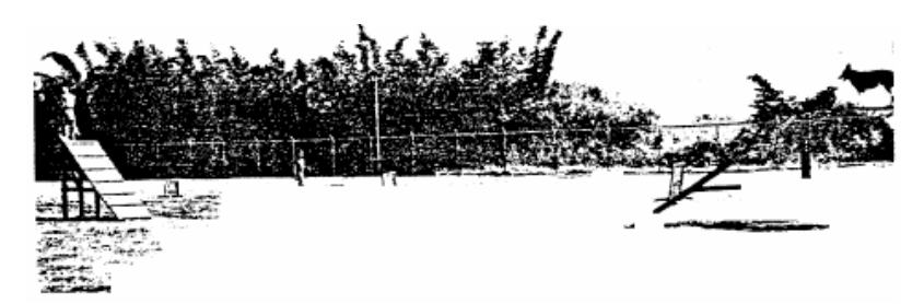
Obstacle Courses Are Necessary for Exercising Dogs

As in the case of human beings, sentry dogs cannot be expected to maintain maximum proficiency unless they are in top physical condition. This means that in addition to receiving proper food and medical care, they must be exercised frequently, regularly and strenuously. An obstacle course, which can be constructed out of salvage materials, provides an excellent medium for such exercise, and all units to which sentry dogs are assigned will insure that such a course is constructed. A good obstacle course should include, but is not limited to: hurdles, ditches and low ramps for jumping; high ramps to teach the dog that wherever his handler takes him he is not to be afraid; tunnels to teach a dog to crawl; and walking logs or ladders raised above and parallel to the ground to teach a dog to be more sure-footed and unafraid wherever his handler takes him.