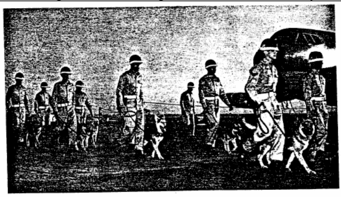
Dogs Walking at "Heel' Position.