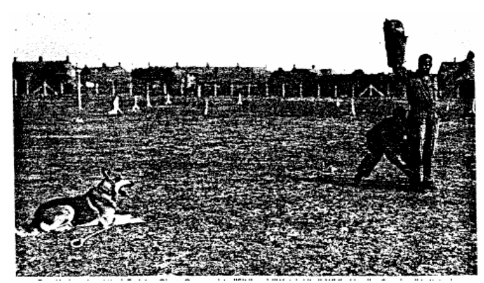
Dog Undergoing Attack Training - Stay and Watch - While handler Searches Aggressor